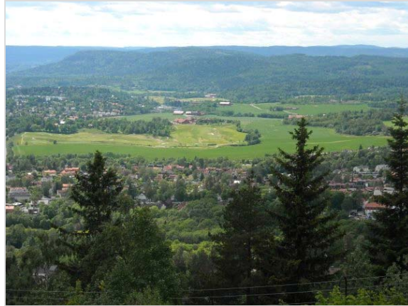
View from Hotel Holmenkollen