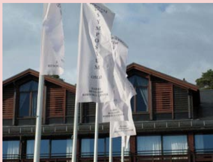
Conference flags outside Hotel