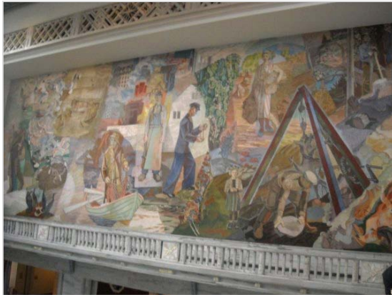
Oslo City Hall interior