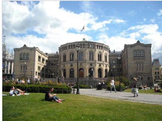
Norwegian Parliament Building