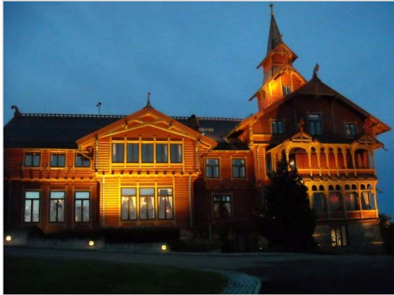
Hotel Holmenkollen at night