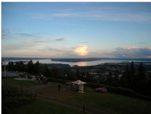
Oslo summer night